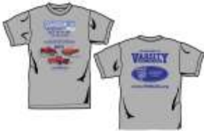
Dearborn 2014 Staff Work shirts