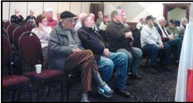
65 members at the meeting