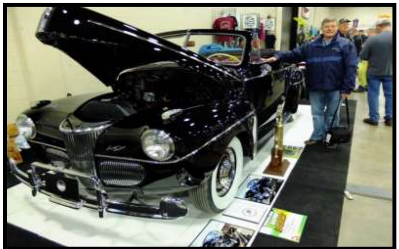
The '41 & me @ Autorama