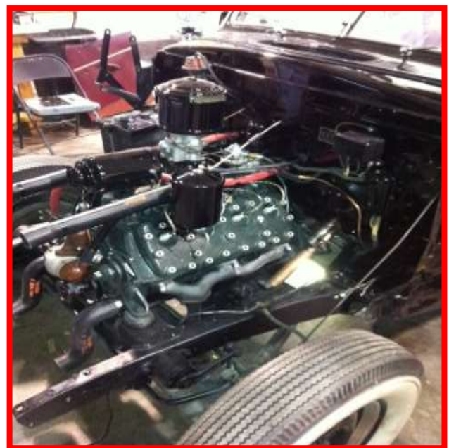
The engine after refinishing & repainting