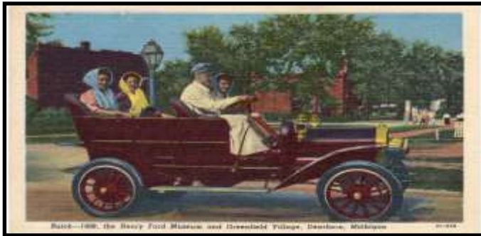
Late 40's early 50's - Greenfield Village

This month another postcard from the late 1940's early 1950's series from Greenfield Village. This series was printed on a cardstock that resembles