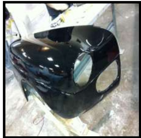
One the front fenders painted black

know of haven't repainted their old Fords with fenders like this. Some more welting had to be obtained to match the welting that I obtained for the front. Before the crash, the convertible top wasn't going up or down very well. I mentioned this to Bill. Bill looked at it & found that the electrical motors that actuated the convertible mechanism were broke from the brackets that are part of the motor housing. Screw jacks actuate the top mechanism. Therefore when electrical energy was applied, the motors just spun. Autumn found a hydraulic set from Hydro Electric that operates on 6 V. Bill & his crew installed this set & the convertible top works much better. I also had Brass Works fabricate radiator that matched the original with the opening in the lower center so that the car could be hand cranked. For me this is just to have the radiator look correct. I wouldn't want to hand crank that engine although some people have said that it wouldn't be that hard to crank the type A flathead that is in my '41.