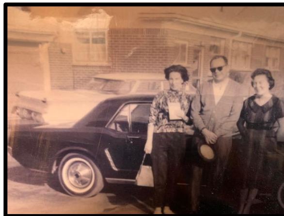
Dad and his 65 Mustang