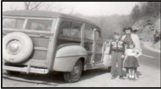
1946 -1948 Ford, place unknown

This month I am again using a photo from my collection rather than a postcard. This month we have a family photo which was probably taken