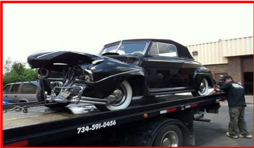
Not a very pretty sight, June, 2012