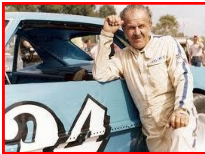
Wendell Scott was the first African American man to win a race in 1969.

With this being February and not only is it Black History month, but the time of year the "roundrounders" migrate to Daytona. Everyone is familiar with Richard Petty and his #43 STP racers so much so "The King" did not even put his name decal on his cars. Another man made his mark in the history of southern stock car racing running his #34- Wendell Oliver Scott. In 1977, the movie "Greased Lightning" was made loosely based on the life and career of Wendell Scott. Although Hollywood altered many facts, the reality of his struggling to overcome and becoming the first Black man to win a Nascar Grand National Race is remarkable.