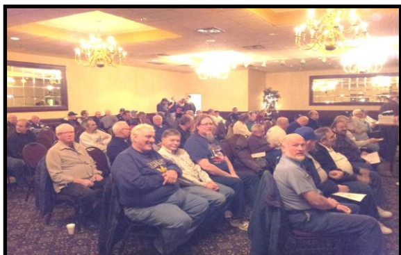
70 members at the February meeting