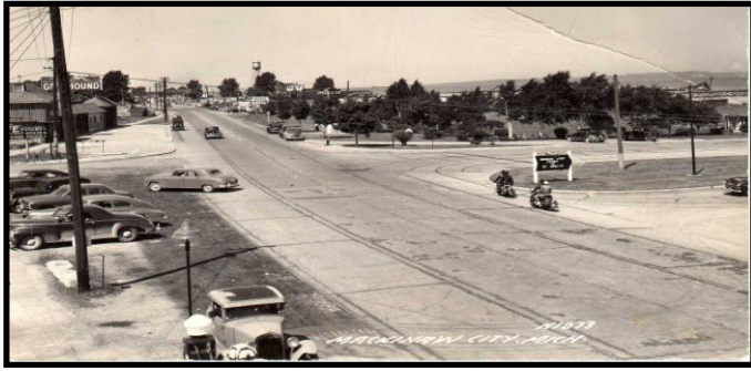
Mackinaw City, Michigan

This month we have a view of Mackinaw City, MI which was probably taken in the late 40's or very early 50's. In the lower edge we see a very collectable Model A coupe sitting in front of an equally collectable