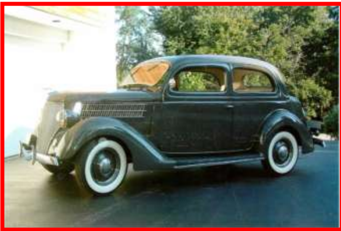
1936 Ford Tudor Deluxe

I bought the car 3 years ago this summer in Amarillo, TX. The car was bought new in south Georgia. Spent most of its life in S. Georgia