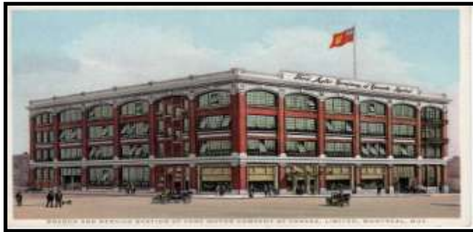
Ford Motor Company of Canada Limited

This month's post card is of the branch and service station of the Ford Motor Company of Canada Limited, in Montreal, Quebec. The post