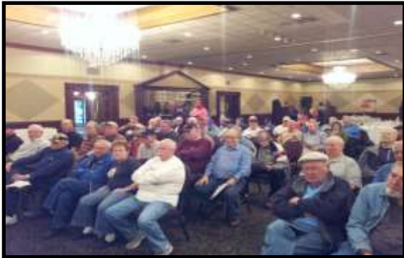
93 members joined us in the "big room".